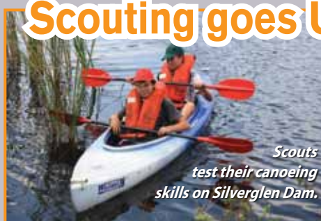
Scouts test their canoeing skills on Silverglen Dam.